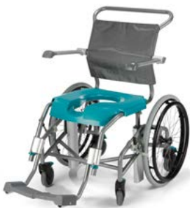
Easy STD Wheels and hand rims